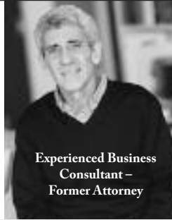
Experienced Business Consultant – Former Attorney