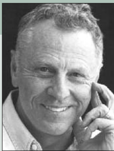
Morris Dees, Esq.

Remember why you became a lawyer? Were you motivated by a family member or a friend? Was it the opportunity to seek justice? Did you want to help the less fortunate? Renew your connection to your calling through an informative and inspirational address by one of our time's most famous attorneys. Attorney Dees is available after the plenary session to speak, informally, with interested Bar members.