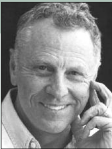
Morris Dees, Esq.

Remember why you became a lawyer? Were you motivated by a family member or a friend? Was it the opportunity to seek justice? Did you want to help the less fortunate? Renew your connection to your calling through an informative and inspirational address by one of our time's most famous attorneys. Attorney Dees is available after the plenary session to speak, informally, with interested Bar members.