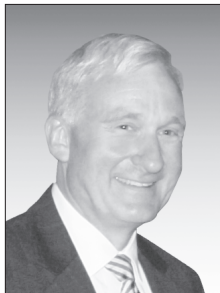
Rhode Island Supreme Court Chief Justice Paul A. Suttell